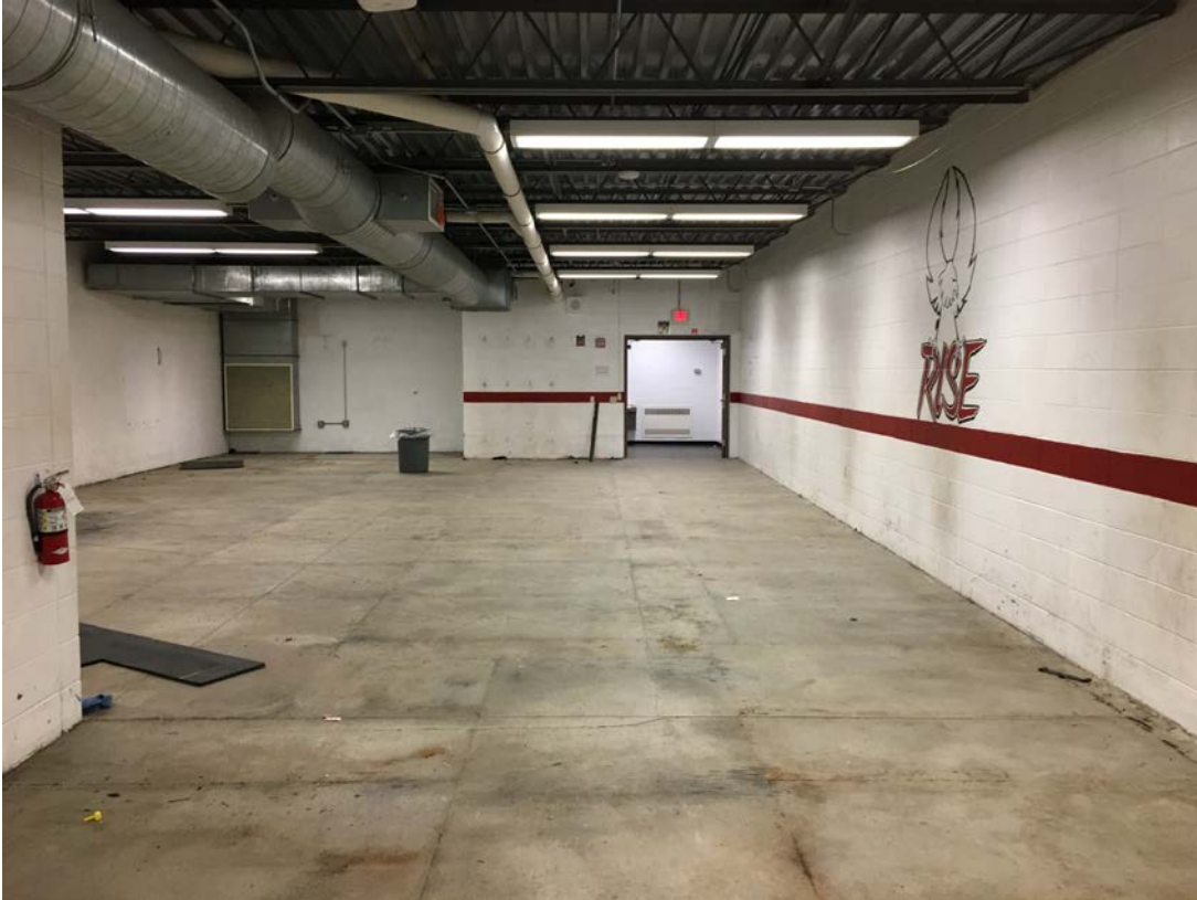
Existing weight room