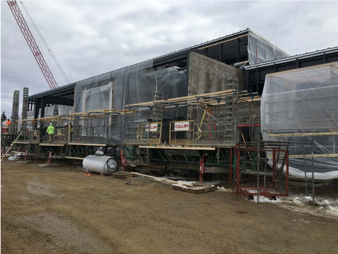
Heated masonry operation at new gym addition