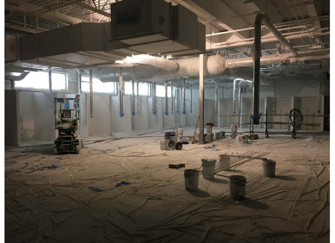
STEM addition- welding booths