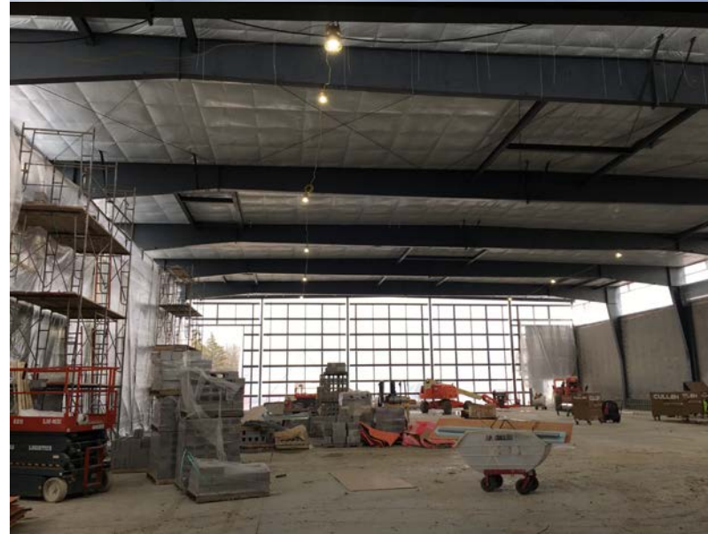
New Gym addition