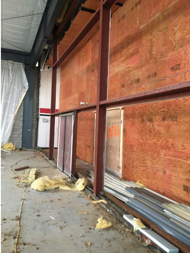
End wall of existing gym being removed