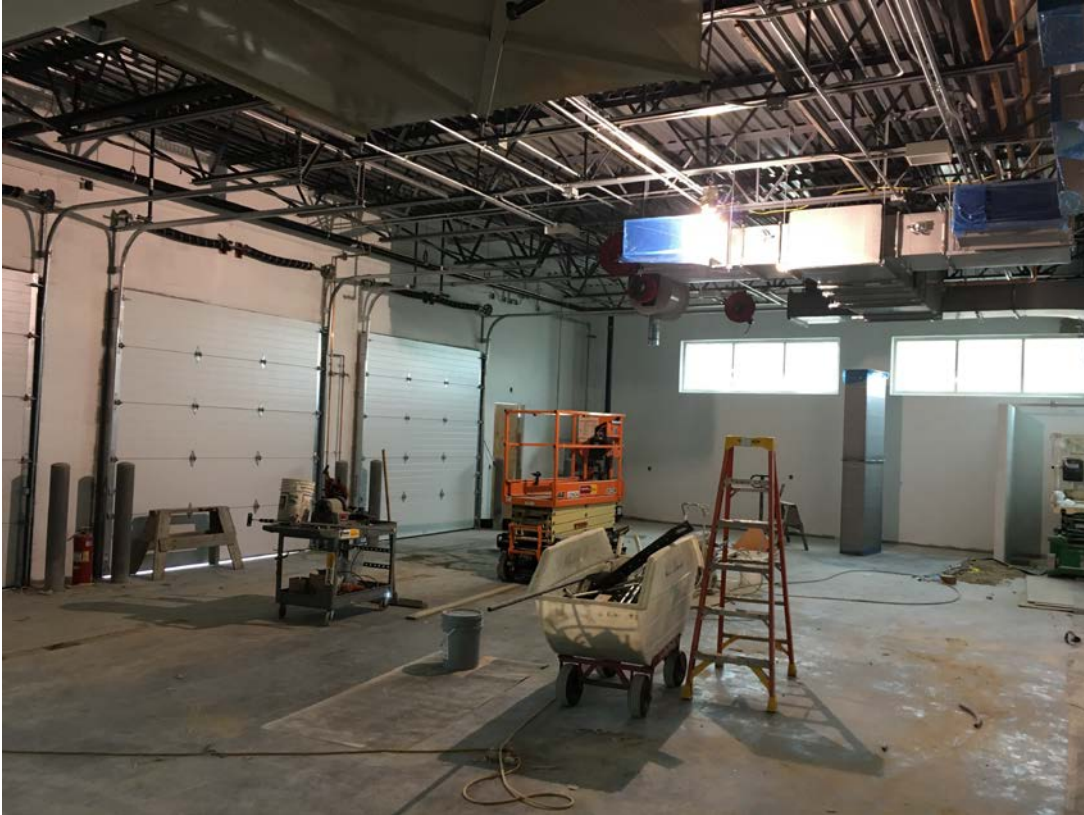
STEM addition- auto shop