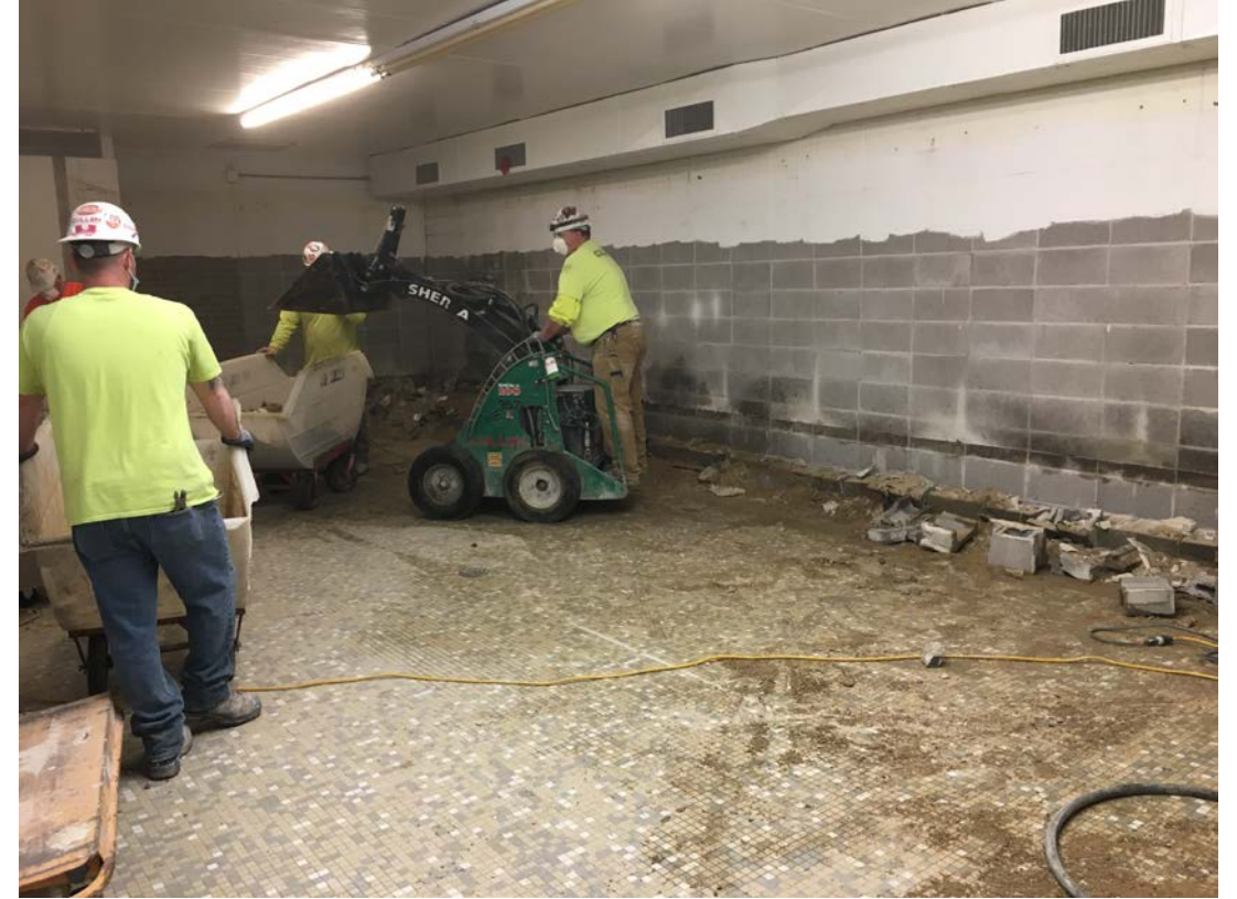
Existing locker room