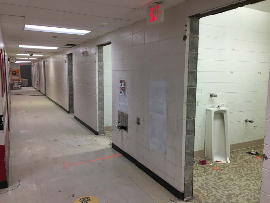
Existing locker room corridor