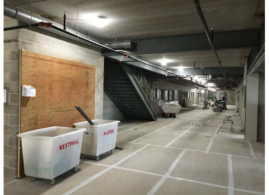
STEM addition- lower-level corridor