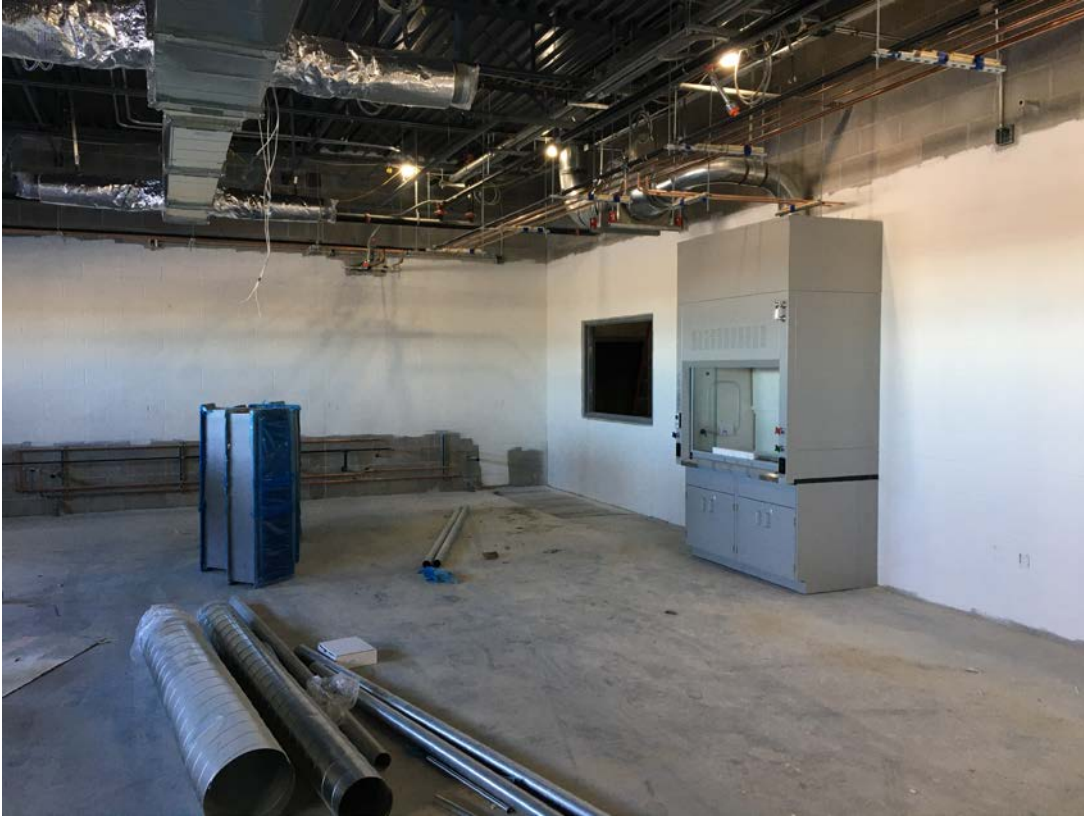
STEM, Science Room