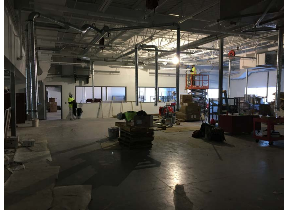
STEM, Woods Shop