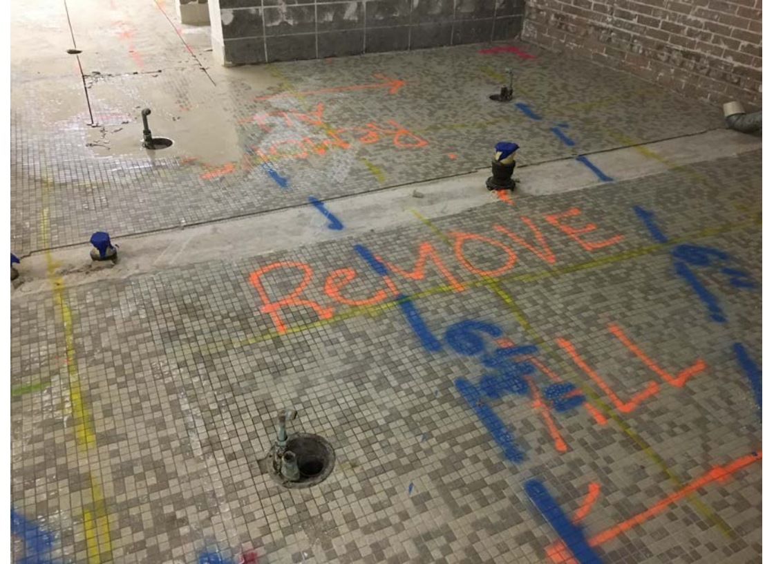
Renovation of locker rooms