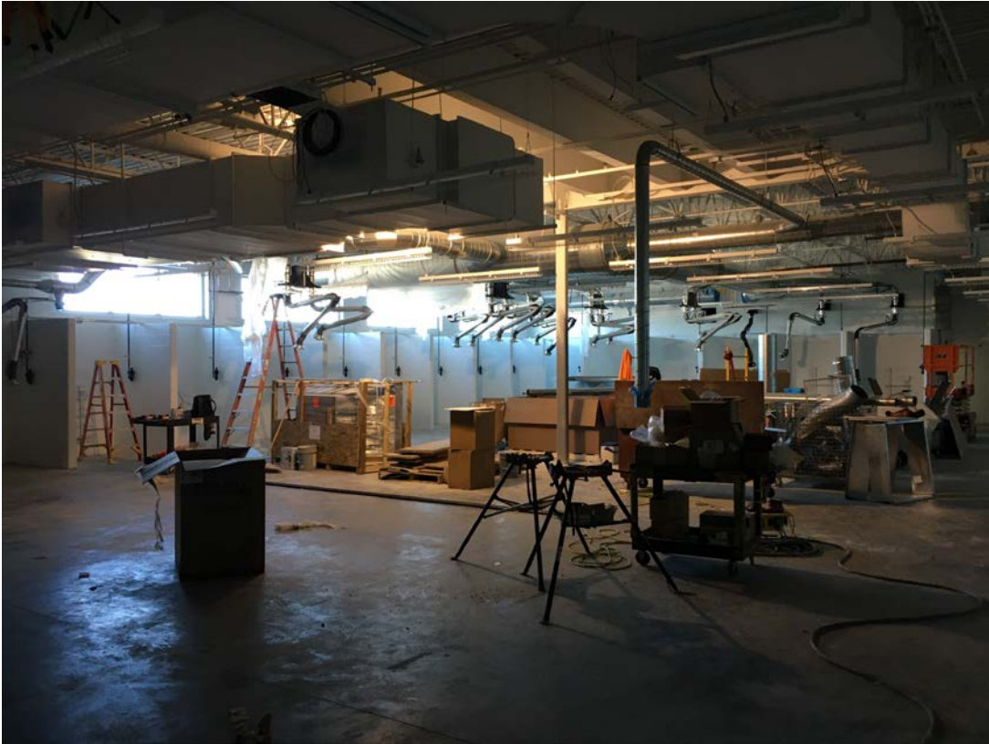
STEM, Metals Shop