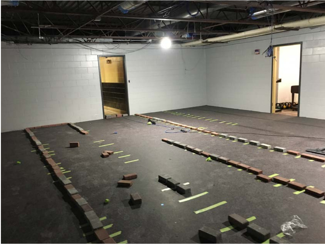
Renovated Weight Room