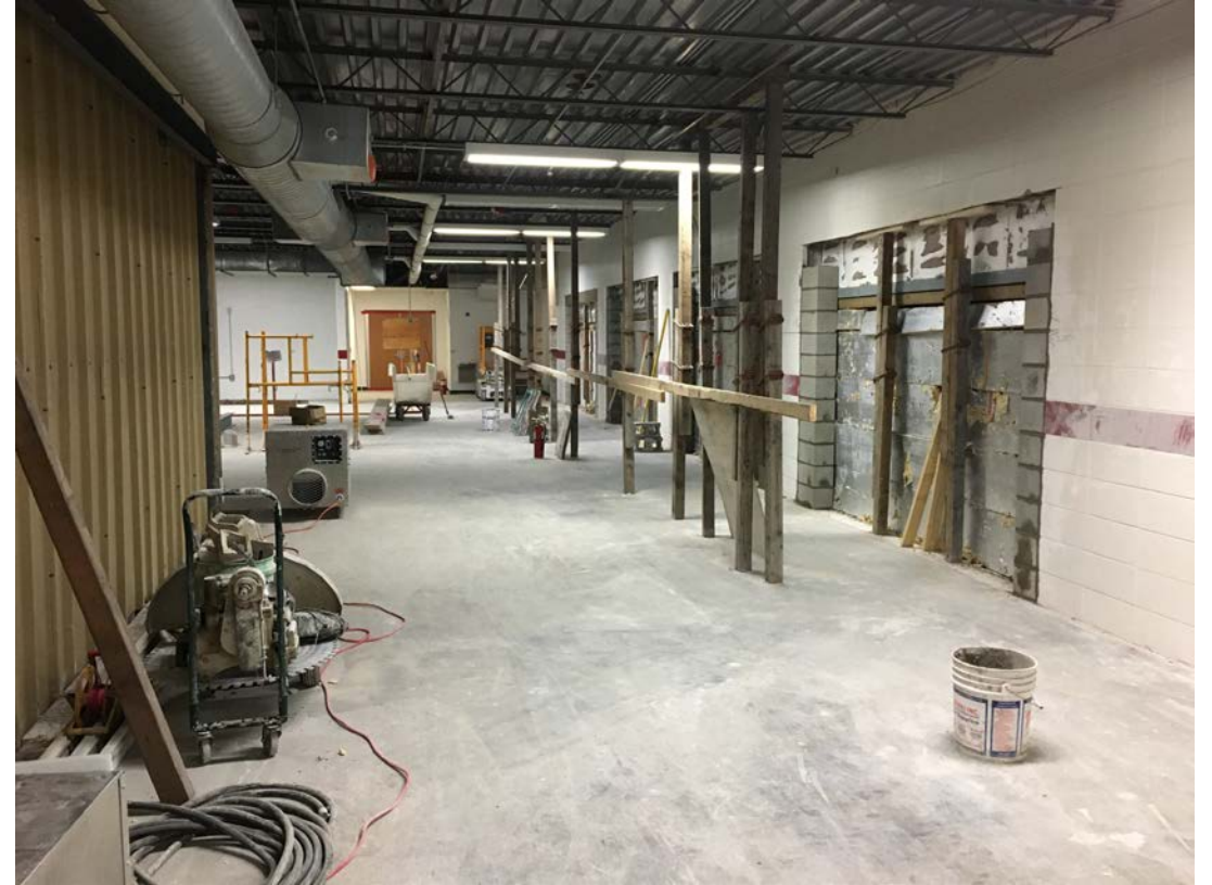
Renovation of weight room