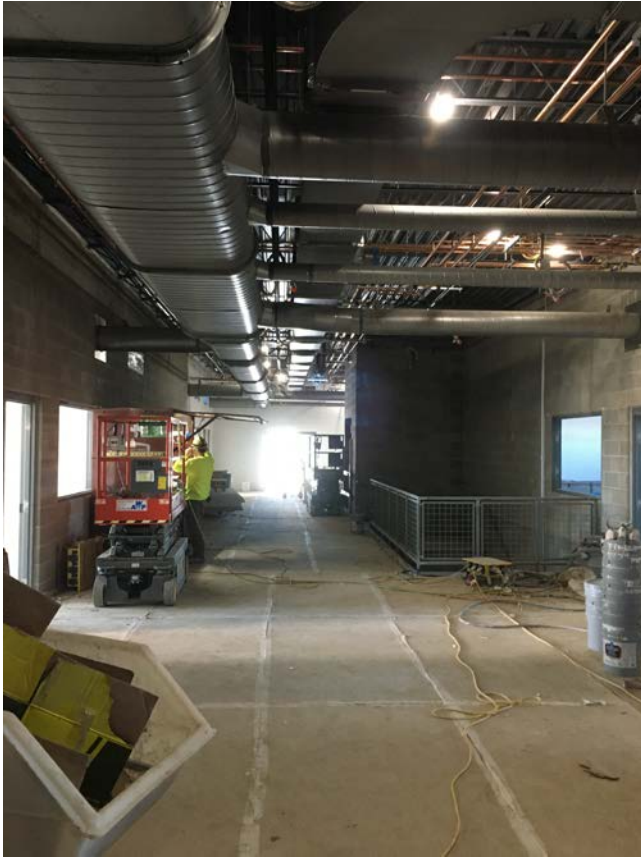
STEM, Upper-Level Corridor