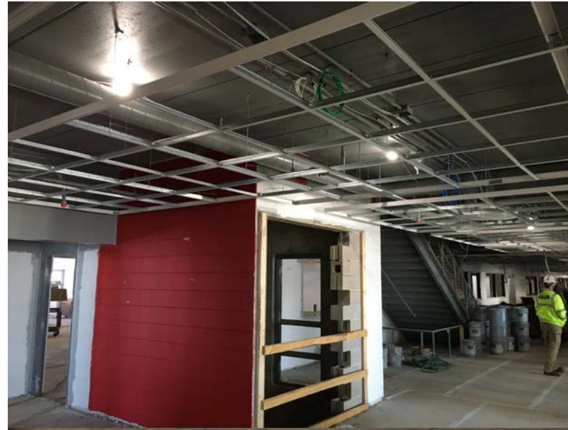
STEM, Lower-Level Corridor