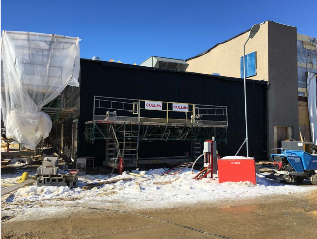
Pool, locker room exterior